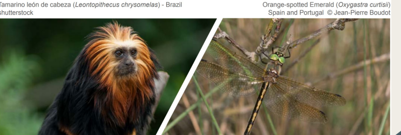
Image 1: Examples of endangered species near facilities (p 42).

Tamarino león de cabeza (Leontopithecus chrysomelas) - Brazil